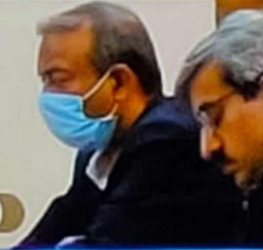
Shri. Ramesh Pokhriyal Nishank (Minister of Education)