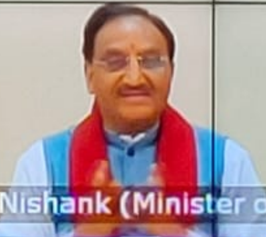
Shri. Ramesh Pokhriyal Nishank (Minister of Education)