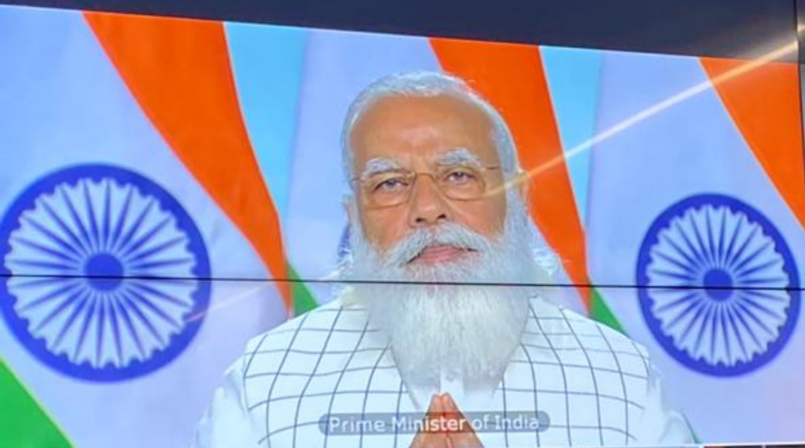
Prime Minister of India