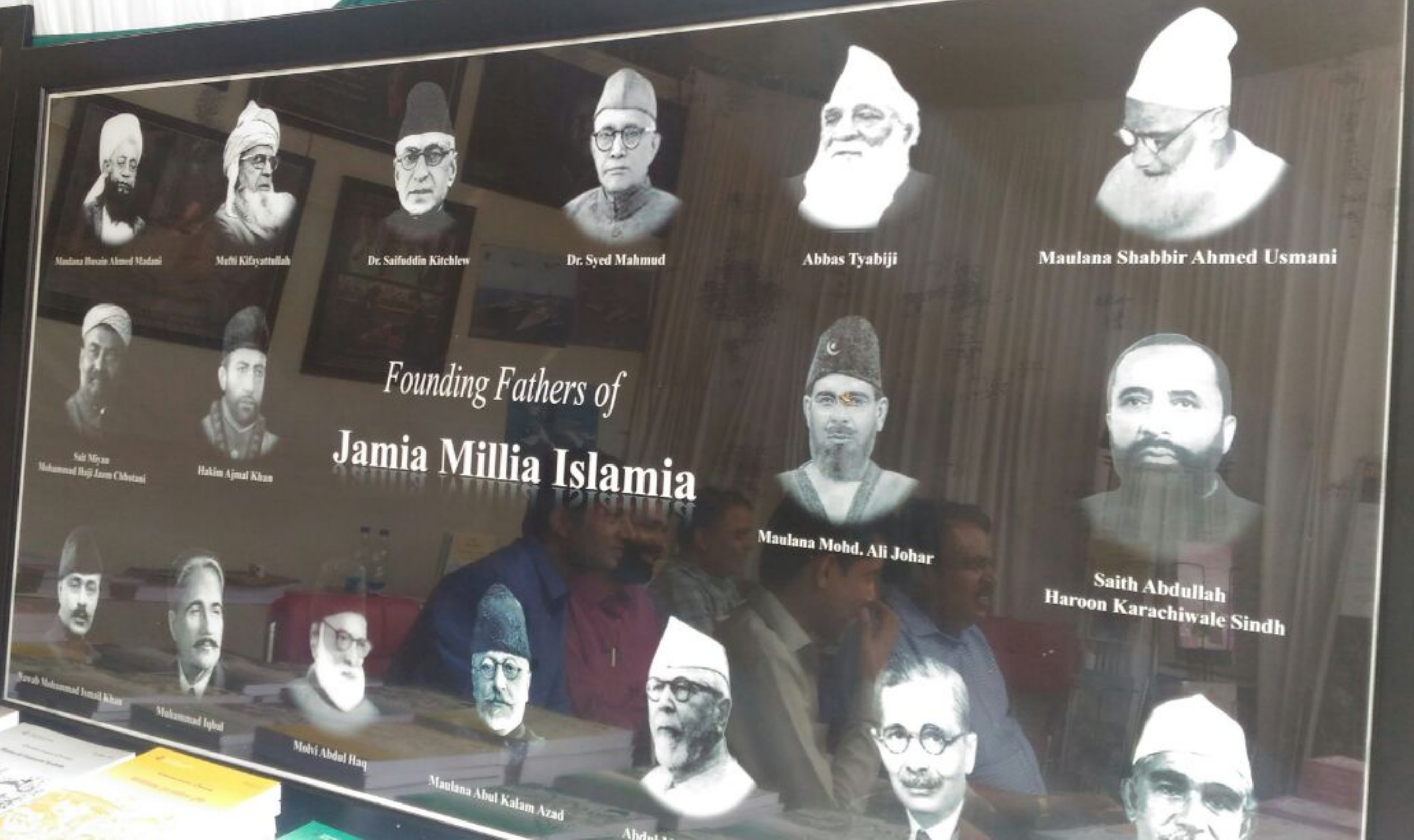
Maulana Husain Ahmed Madani