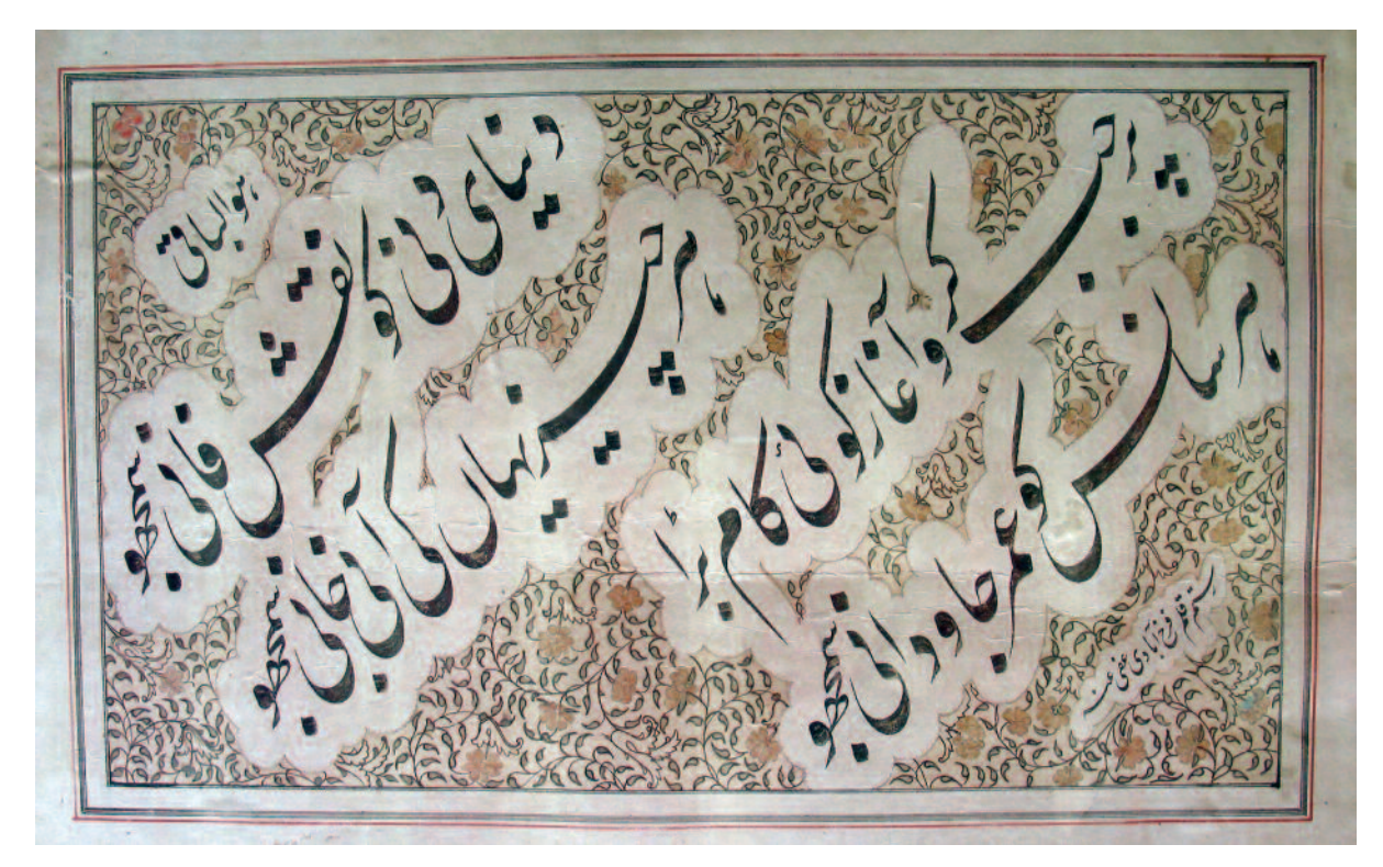
Back to where it belonged: One of the priceless pieces of calligraphy gifted to Jamia by the author

tional books and expresses sorrow about a fire that had burned down the press. Gandhiji wrote the letter in Urdu and mailed it to my father in an envelope he had himself made!