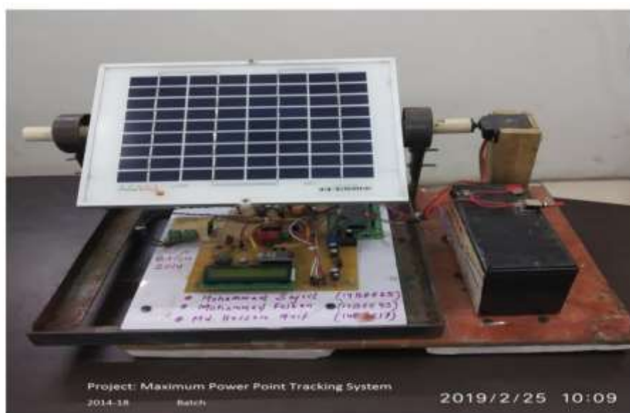
Maximum Power Point Tracking System