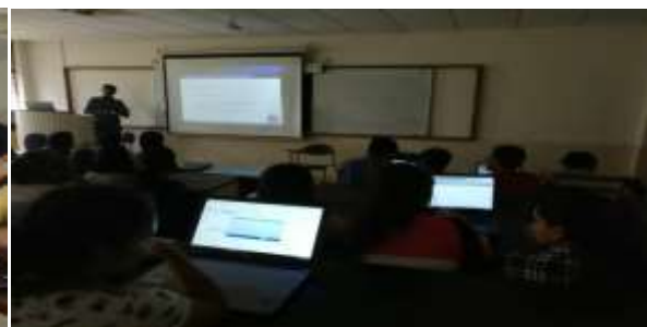
Workshop on MATLAB