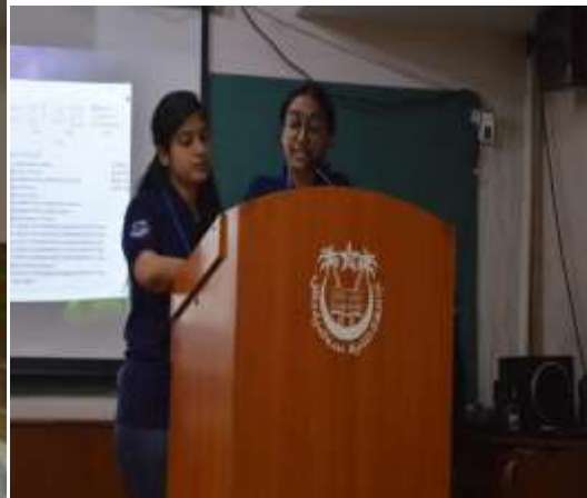
Technical talk on Cloud Computing