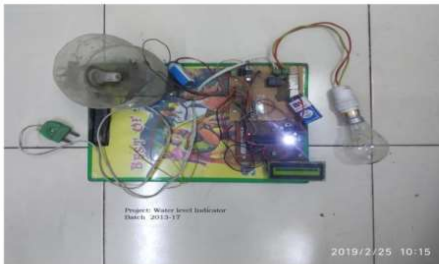
Water Level indicator

Water level indicator is one of the projects related to industry. The prototype water level indicator is used for different water level pumping and monitoring in industries. Similarly, maximum power point tracking system is one of the other projects related to industry.