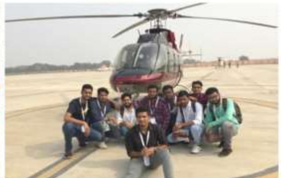
Fig. Industrial visit of students to Pawan Hans Ltd. Rohni, Delhi