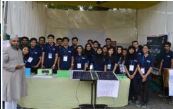
Participation at Talimi Mela