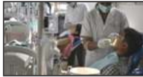
Orthodontics and Dentofacial Orthopedics