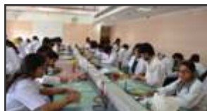
Prosthodontics Preclinical Lab