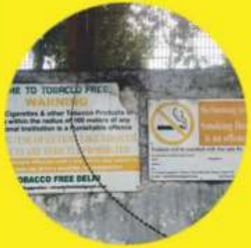
Oral Cancer Awareness