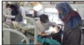
Public Health Dentistry