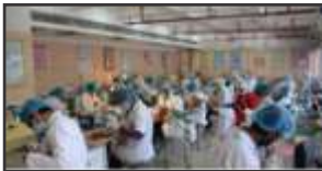
Conservative Dentistry Preclinical Lab