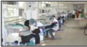
Conservative Dentistry & Endodontics