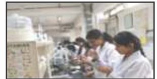
Physiology & Biochemistry Lab