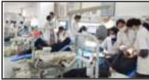
Oral Medicine and Radiology