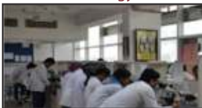
DADH & Oral Pathology Lab