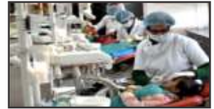
Pediatric & Preventive Dentistry