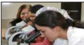
General Pathology & Microbiology Lab