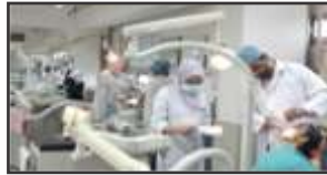
Oral and Maxillofacial Surgery