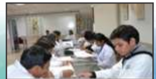
Human Anatomy & Histology Lab