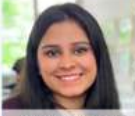
Nair Hospital Mumbai