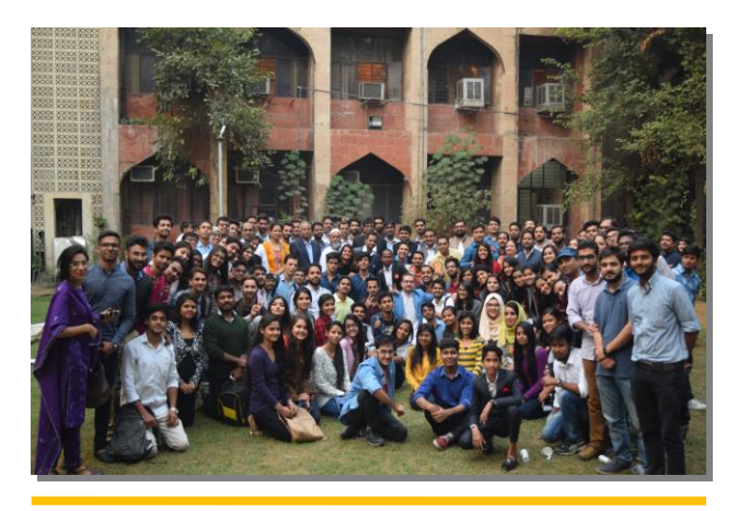
Economics Alumni Meet 2016, organised by Department of Economics