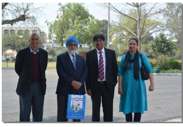
The faculty members of the department with the Guest of Honour at International Symposium, Sh. Montek Singh Alhuwalia (Deputy Chairman of the Planning Commission of India)