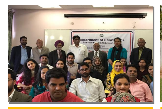
Two-Week Research Methodology Workshop on "Econometrics Techniques: Theory & Applications