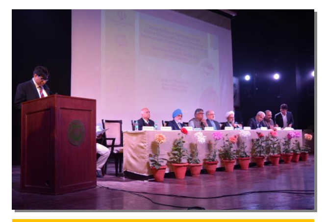
International Symposium on India's Strategy of Economic Growth and Development: Experiences and Way Forward by the Department of Economics, JMI