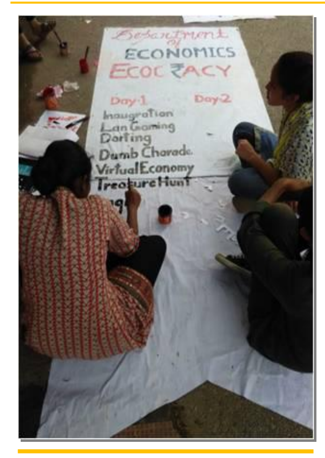
Students at work for the Annual Fest of the Department of Economics, JMI- Ecocracy