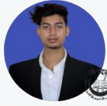
NAME: MD TAHSIN PROJECT: WEBSITE DEVELOPMENT