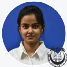
NAME: ANAM INTERNSHIP: INDO STAR INSULATIONS PVT. LTD