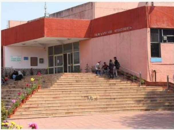
M.A. ANSARI AUDITORIUM