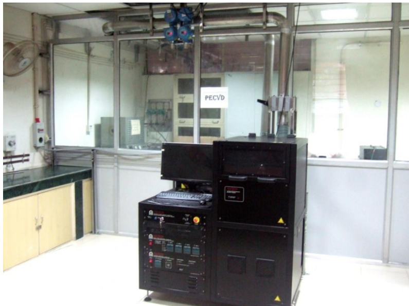
PECVD CNT Growth System with Enclosure Exhaust, JMI

The aim of the project is to synthesize and characterize single wall carbon nanotubes (SWNTs) using Plasma Enhanced Chemical Vapor Deposition (PECVD) technique and to study their characteristics for semiconducting applications. Recently, PECVD (Black Magic 2” System, from M/S AIXTRON, UK) has been installed for the growth of SWCNTs. SWCNTs samples of 1 nm with 90% purity are available at Materials Science Lab of Department of Physics, JMI.