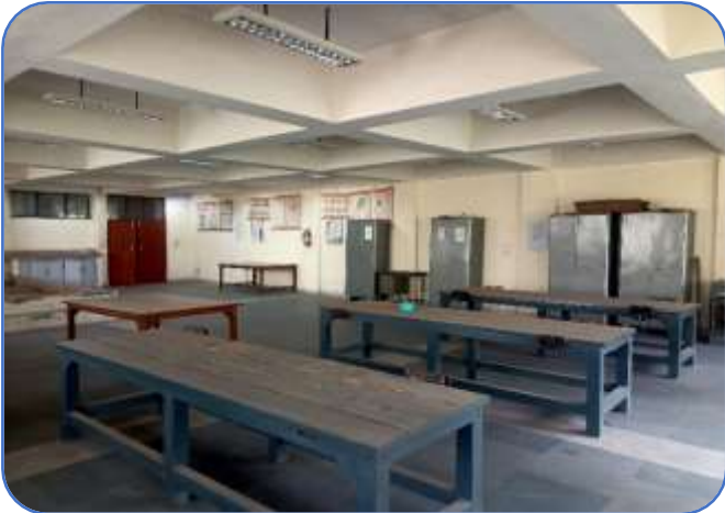
Pattern Making Shop