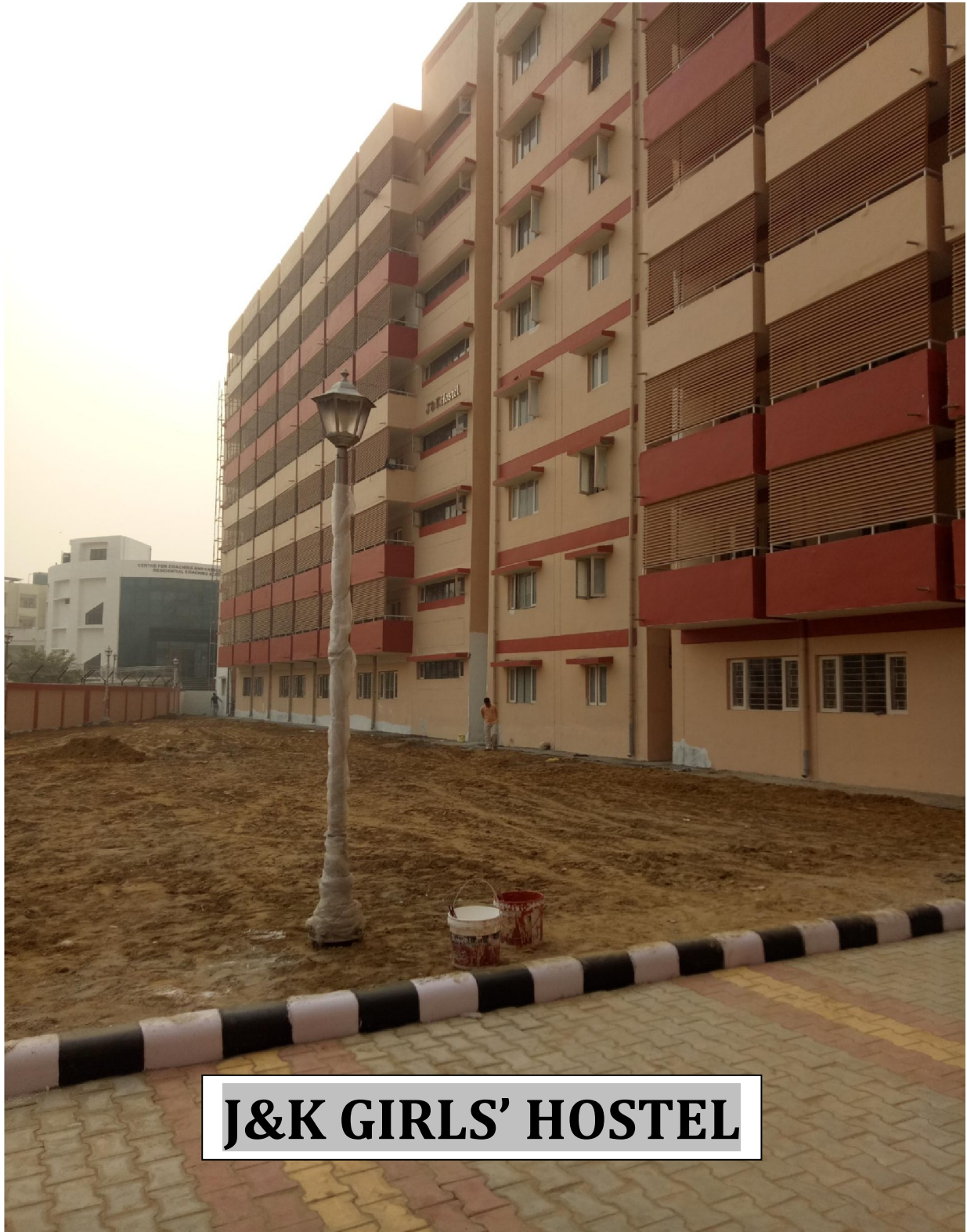
J&K GIRLS' HOSTEL

J & K is a newly built 700-bedded hostel for bonafide female students of Jamia Millia Islamia. It is situated next to Begum Hazrat Mahal Girls' Hostel on Campus B.