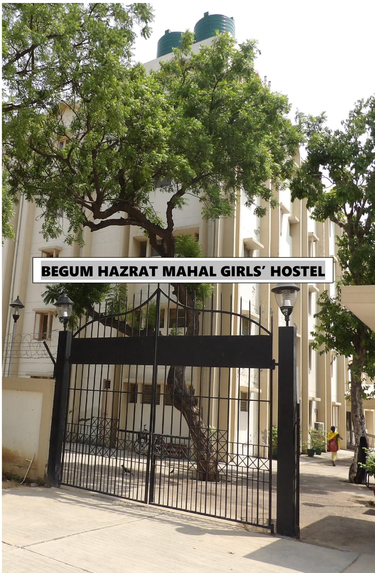
BEGUM HAZRAT MAHAL GIRLS' HOSTEL