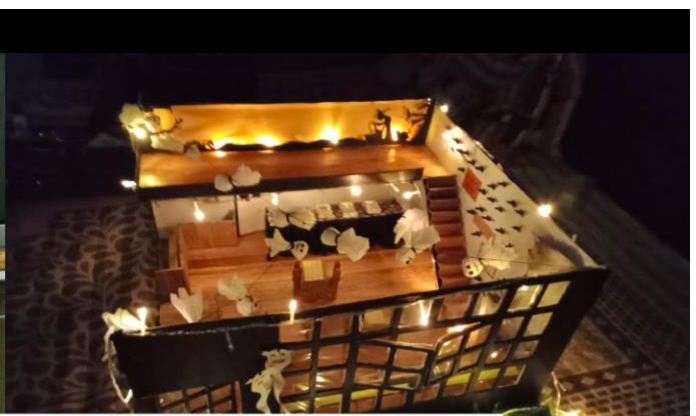
DAY AND NIGHT VIEW OF HALOWEEN DECORATION IN RESTAURANT