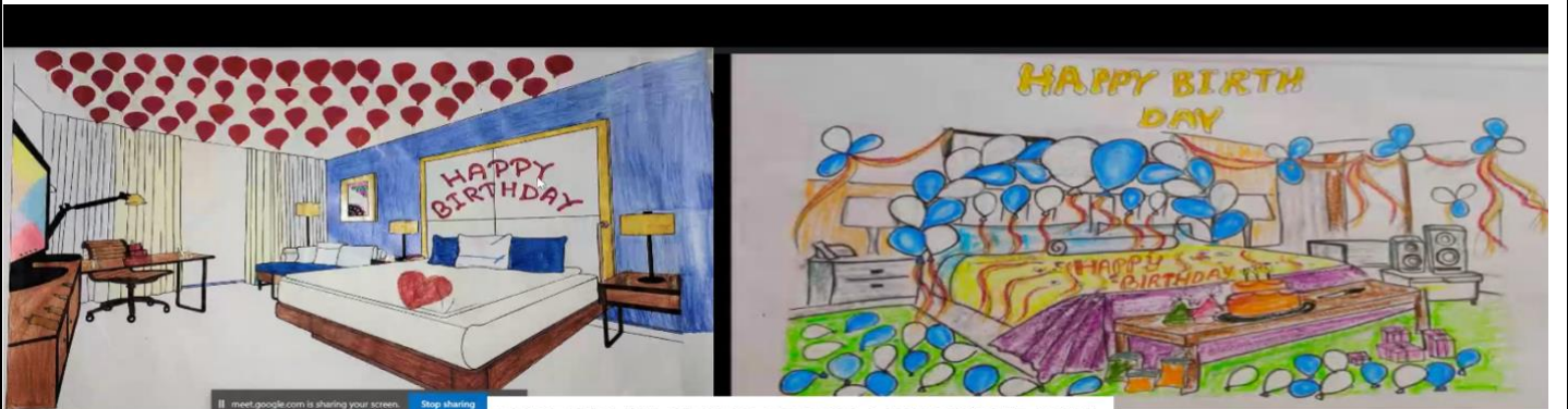
BIRTHDAY GUEST ROOM DECORATION