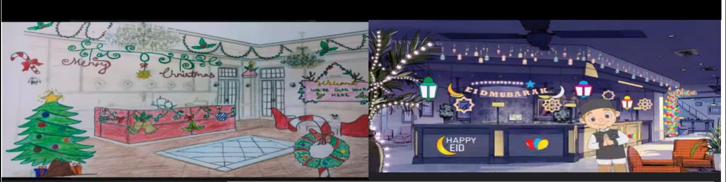
HOTEL LOBBY DECORATION