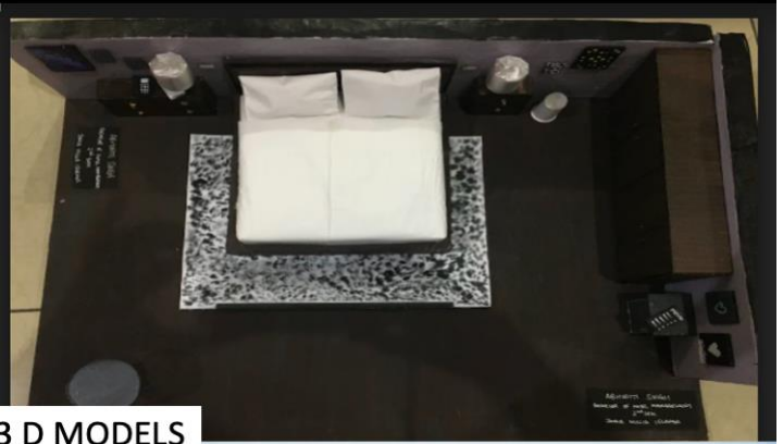
GUEST ROOM 3 D MODELS