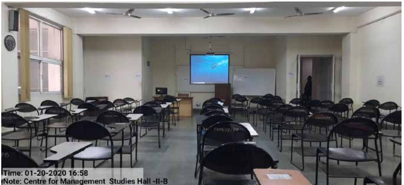
Time: 01-20-2020 16:58 Note: Centre for Management Studies Hall -II-B