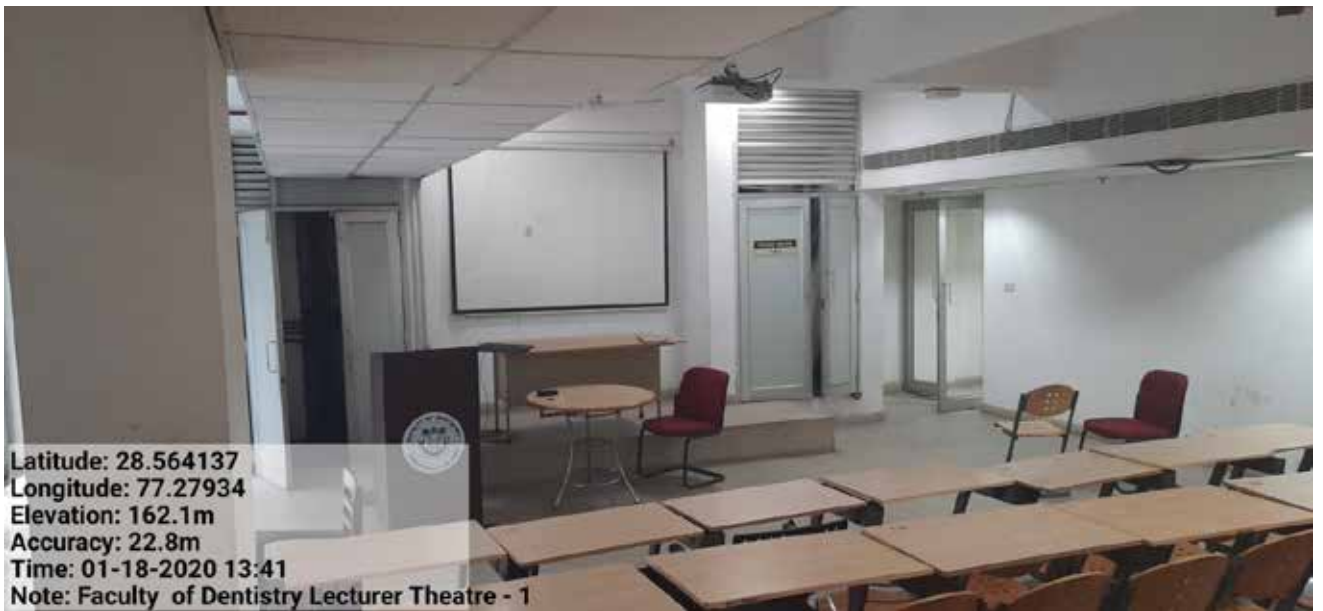
Latitude: 28.564137 Longitude: 77.27934 Elevation: 162.1m Accuracy: 22.8m Time: 01-18-2020 13:41 Note: Faculty of Dentistry Lecturer Theatre - 1