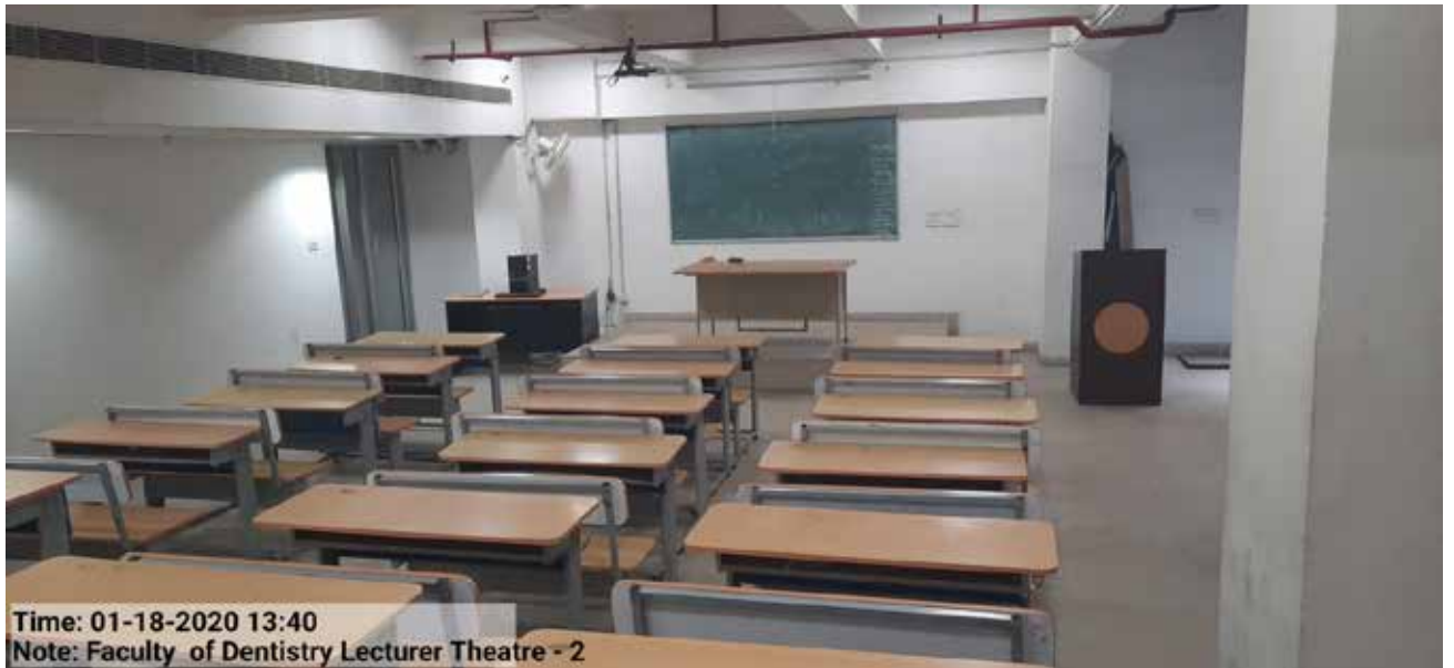
Time: 01-18-2020 13:40 Note: Faculty of Dentistry Lecturer Theatre - 2