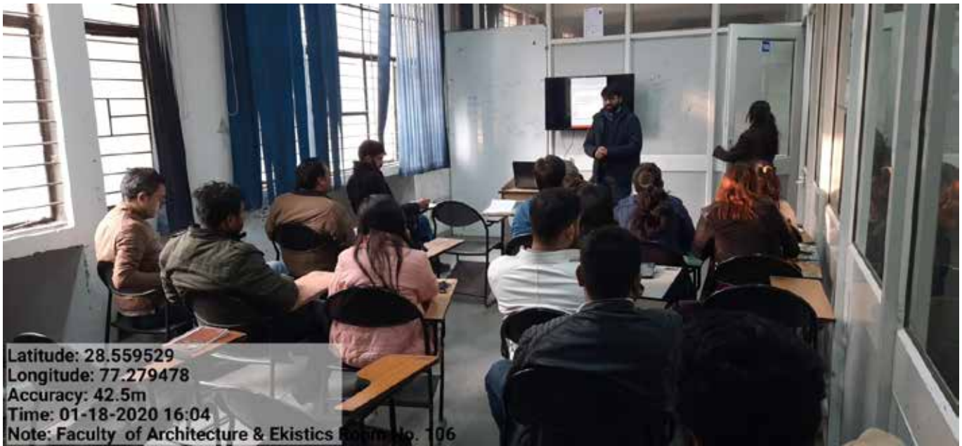
Latitude: 28.559529 Longitude: 77.279478 Accuracy: 42.5m Time: 01-18-2020 16:04 Note: Faculty of Architecture & Ekistics Room No. 106