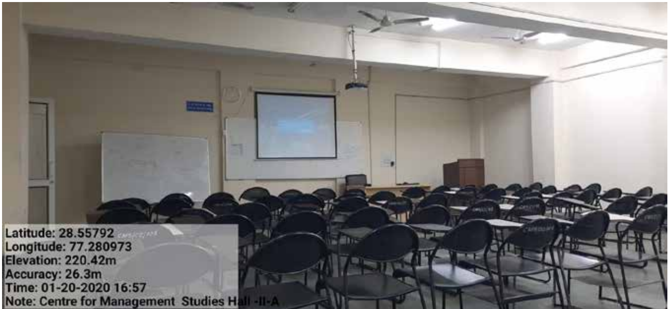
Latitude: 28.55792 Longitude: 77.280973 Elevation: 220.42m Accuracy: 26.3m Time: 01-20-2020 16:57 Note: Centre for Management Studies Hall -II-A