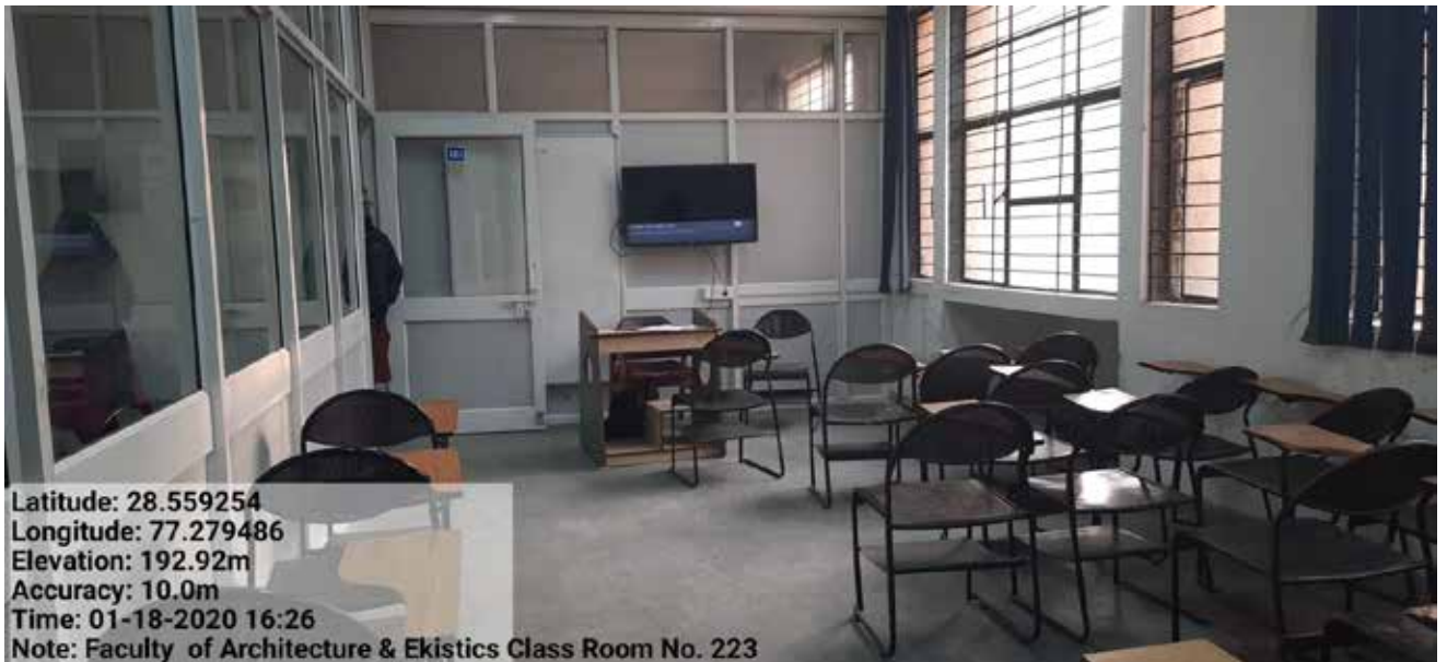
Latitude: 28.559254 Longitude: 77.279486 Elevation: 192.92m Accuracy: 10.0m Time: 01-18-2020 16:26 Note: Faculty of Architecture & Ekistics Class Room No. 223