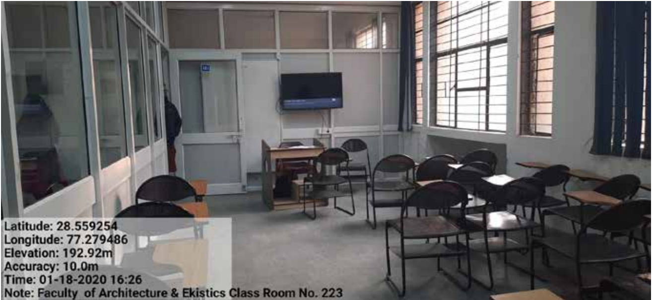
Latitude: 28.559254 Longitude: 77.279486 Elevation: 192.92m Accuracy: 10.0m Time: 01-18-2020 16:26 Note: Faculty of Architecture & Ekistics Class Room No. 223