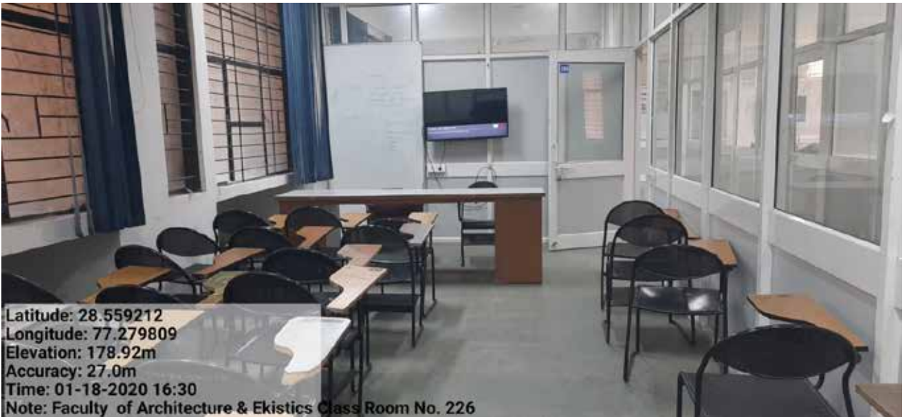
Latitude: 28.559212 Longitude: 77.279809 Elevation: 178.92m Accuracy: 27.0m Time: 01-18-2020 16:30 Note: Faculty of Architecture & Ekistics Class Room No. 226